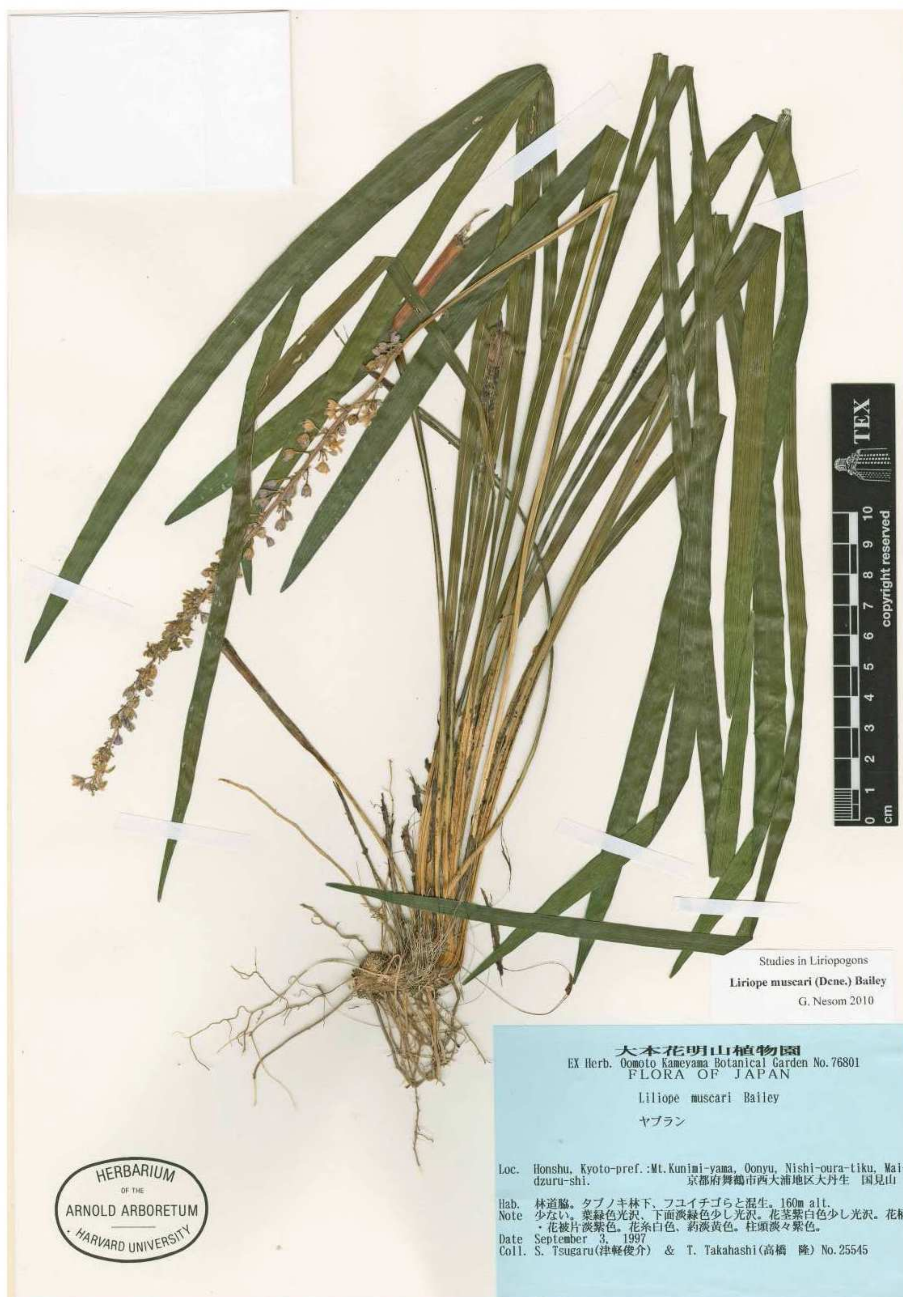
Figure 3. Liriope muscari , typical expression. Note the short, thickened rhizome, apparently more commonly characteristic of this species in Japan than elsewhere.